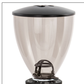
Hopper capacity 1 kg (h 505mm)