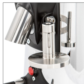
Stainless steel tamper